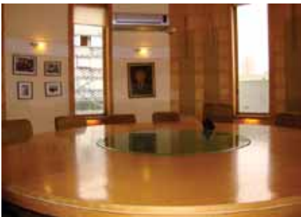
Pravinchandra Gandhi Board Room (4th Floor)