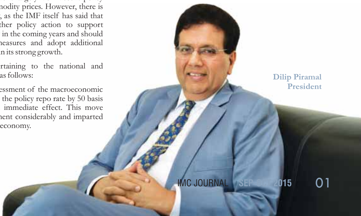
Dilip Piramal President

The government is presently restructuring the economy through incisive combinations of visionary policies and innovative initiatives. It deserves support of all sections of society in achieving basic objectives of sustainable growth and development through job creation.