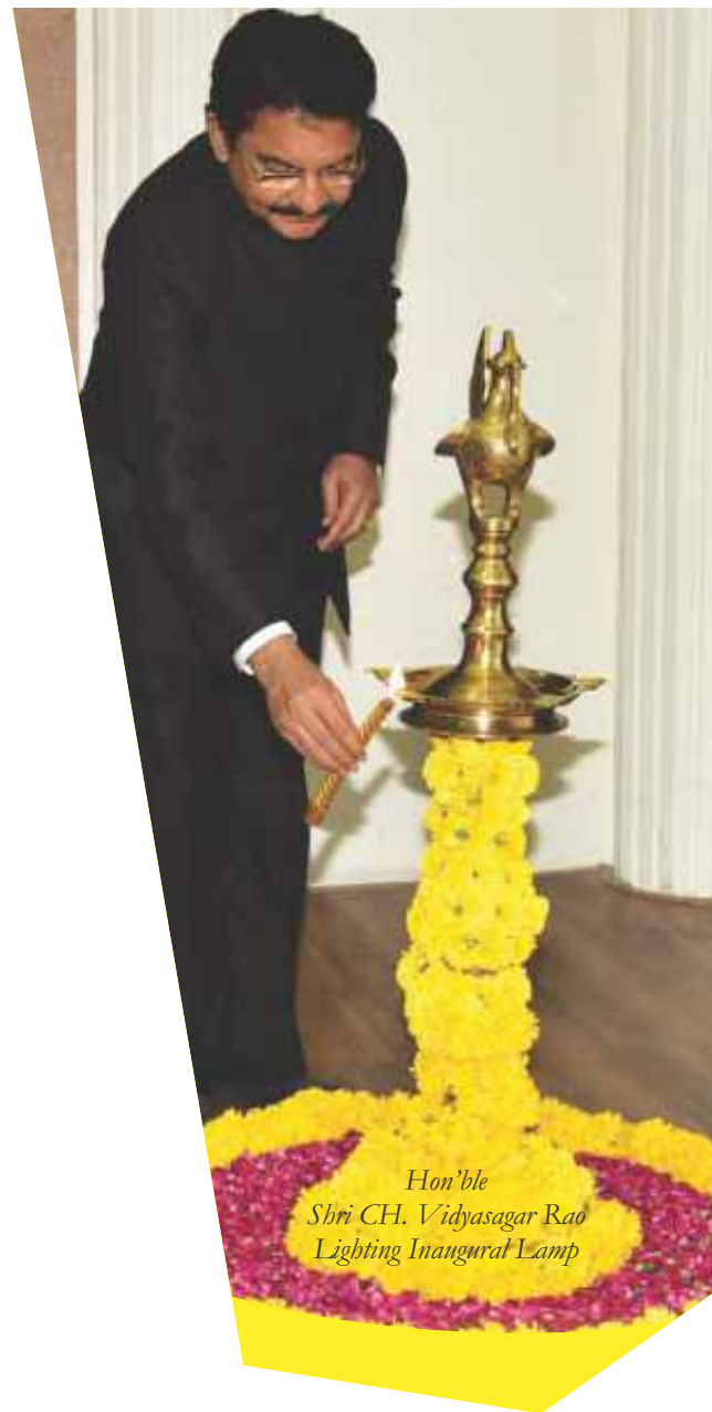
Hon'ble Shri CH. Vidyasagar Rao Lighting Inaugural Lamp

The Governor began his address by stating that India has all the necessary ingredients to grow on a sustainable basis for a long time to come. The Government is creating a conducive policy environment and it is now up to Chambers of Commerce like the IMC to take full advantage of it. Complimenting the IMC on the momentous occasion, he said that the world is looking up to India as an emerging superpower even as the World Bank and the OECD have projected a GDP growth rate in excess of 7% for the current year. Upbeat about India's economic prospects, he said that Maharashtra now needs to emerge as the Start-Up Capital of the country, on the lines of Delhi and Hyderabad. He saw a lot of potential in the State and said that there is no reason why that could not become a reality.