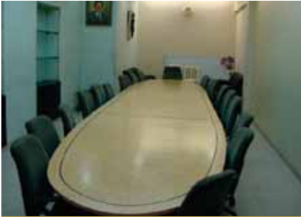
Ashok Birla Board Room (3rd Floor)