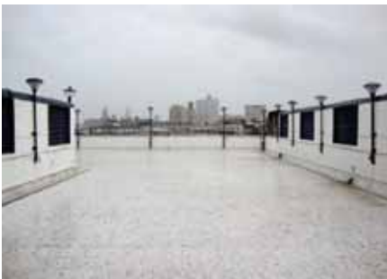
Jamshed Guzdar Terrace