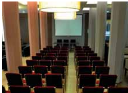
IMC Library Lounge (Resham Bhavan, 3rd floor)