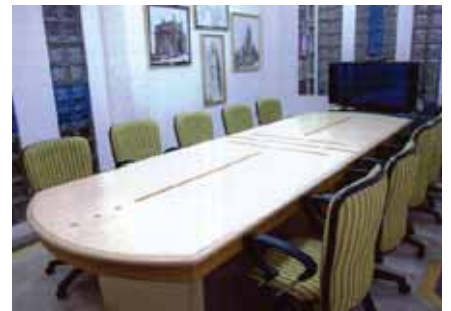
Ramona Taru Lalwani Board Room (Resham Bhavan, 3rd floor)