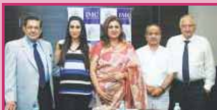
Ms. Karisma Kapoor presenting the donation cheque to Shanti Avedna Sadan