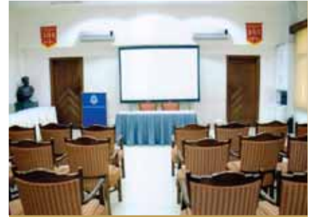
Kilachand Conference Room (2nd Floor)