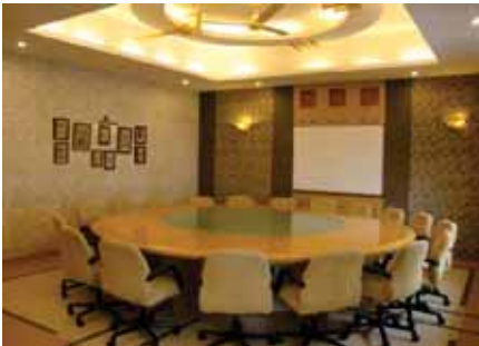
H T Parekh Conference Room (4th Floor)