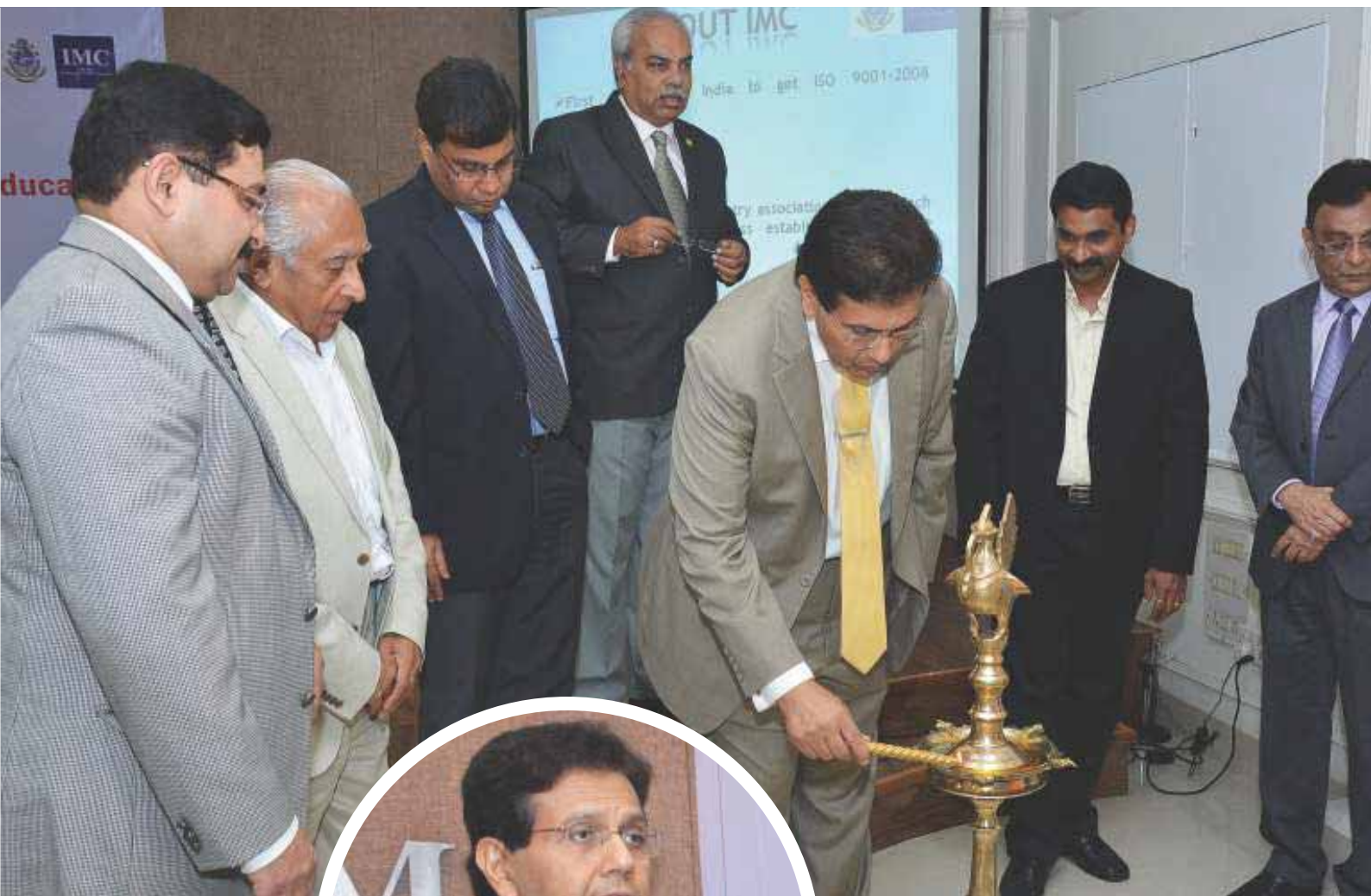
Lighting of Inaugural Lamp by Dignitaries