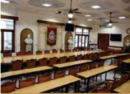
Babubhai Chinai Committee Room (2nd Floor)