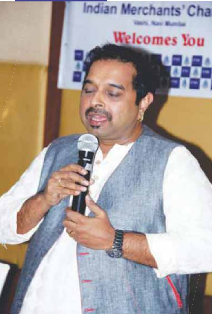
Mr. Shankar Mahadevan