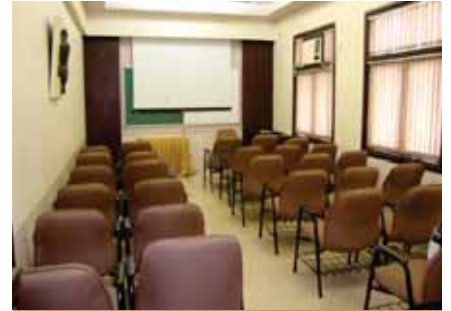
Walchand Centre for Business Training (3rd Floor)

Make the most of your limited time, let the Indian Merchants' Chamber, Churchgate fulfil your business requirements.