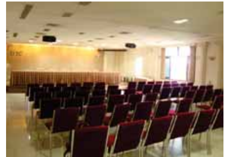
Walchand Hirachand Hall (4th Floor)