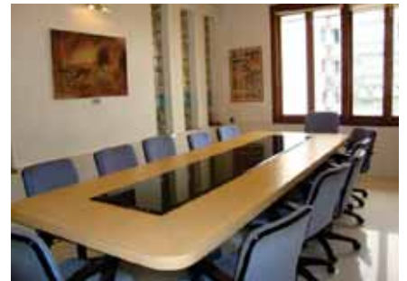
Jolly Conference Room (4th Floor)