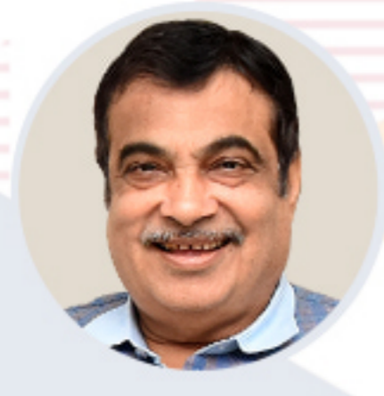
Hon'ble Shri Nitin Gadkari Union Minister of Road Transport and Highways, Micro, Small & Medium Enterprises