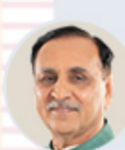
Hon'ble Shri Vijay Rupani Chief Minister of Gujarat