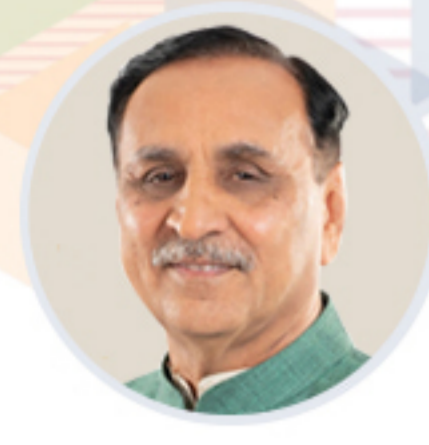
Hon'ble Shri Vijay Rupani Chief Minister of Gujarat