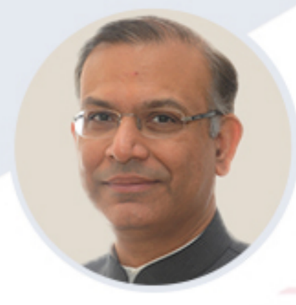
Hon'ble Shri Jayant Sinha Chairperson, Parliamentary Standing Committee for Finance, Member of Parliament