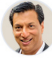
Madhur Bhandarkar Acclaimed Award Winning Filmmaker