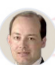
Hon. Geoffrey Connor* Former Texas Secretary of State