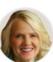
Lt. Governor Bethany Hall-Long State of Delaware