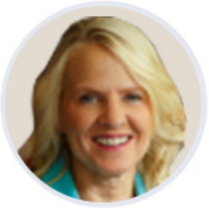
Lt. Governor Bethany Hall-Long State of Delaware