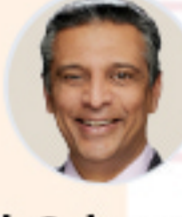
Rajesh Subramaniam President and Chief Operating Officer FedEx Corporation