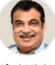
Hon'ble Shri Nitin Gadkari Union Minister of Road Transport and Highways, Micro, Small & Medium Enterprises