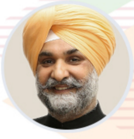
H.E. Taranjit Singh Sandhu Ambassador of India to United States Embassy of India