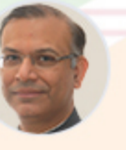
Hon'ble Shri Jayant Sinha Chairperson, Parliamentary Standing Committee for Finance, Member of Parliament