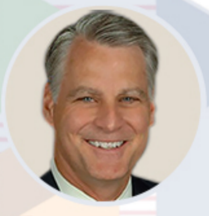
H.E. Ambassador Timothy Roemer Executive Director and Strategic Counselor at APCO Worldwide